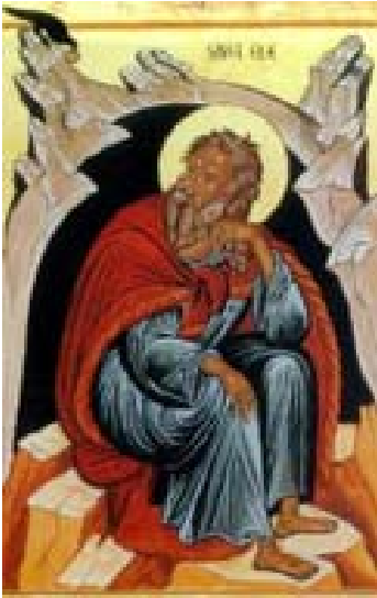
Elijah the Prophet

This is in Matthew, Chapter 17, Verse 11.