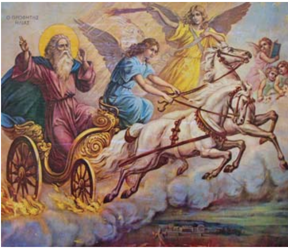
Elijah in the Chariot of Fire

"But remember ye the Law of Moses, my servant, which I commanded Him unto Horeb for all Israel, with the statutes and judgments." God is saying, remember, I once pronounced exactly what My Will was on Earth. I believe the next words really introduce the spirit of what the message is today. "Behold, I will send you Elijah, the prophet, before the coming of the great and dreadful day of the Lord." Now that's a pretty profound statement. Is God saying He is going to violate His Law against reincarnation? We know that on the Mount of Transfiguration that Elijah actually appeared with Moses. Now Elijah never died. He was scooped away by a "UFO" that was referred to as a Heavenly vehicle, with fire and a rocket-type description given by the man who saw him leave – Elisha, who received his mantle and became the prophet, and took over the job that Elijah left.