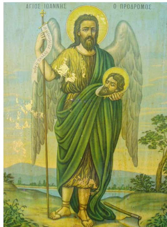
Saint John the Baptist

Let me read to you the last chapter in Malachi, which should pertain to the last chapter of the way things are operated today. That not only includes the